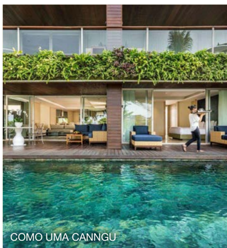
COMO UMA CANGU

Retreat to the ultimate privacy in a residence