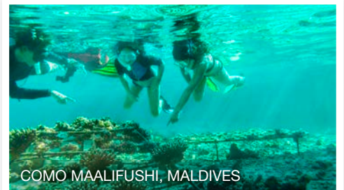
COMO MAALIFUSHI, MALDIVES

Retreat to the ultimate privacy in a residence