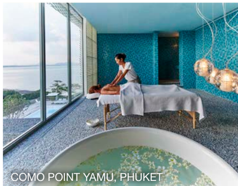
COMO POINT YAMU, PHUKET

Replenish mind, body and soul with a yoga class