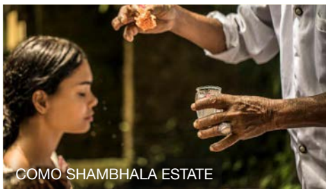
COMO SHAMBHALA ESTATE