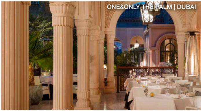
ONE&ONLY THE PALM | DUBAI