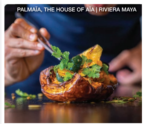
PALMAIA, THE HOUSE OF AIA | RIVIERA MAYA