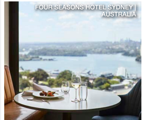
FOUR SEASONS HOTEL SYDNEY | AUSTRALIA