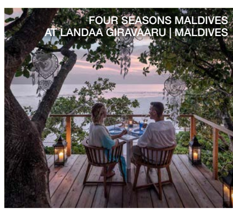
FOUR SEASONS MALDIVES AT LANDAA GIRAARAU | MALDIVES