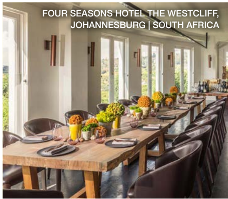
FOUR SEASONS HOTEL THE WESTCLIFF, JOHANNESBURG | SOUTH AFRICA