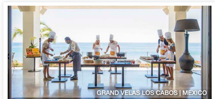
GRAND VELAS LOS CABOS | MEXICO