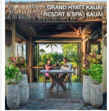
GRAND HYATT KAUAI RESORT & SPA | KAUAI