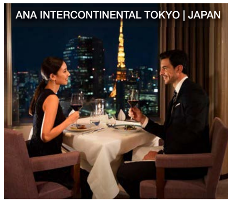
ANA INTERCONTINENTAL TOKYO | JAPAN