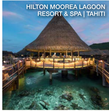
HILTON MOOREA LAGOON RESORT & SPA | TAHITI