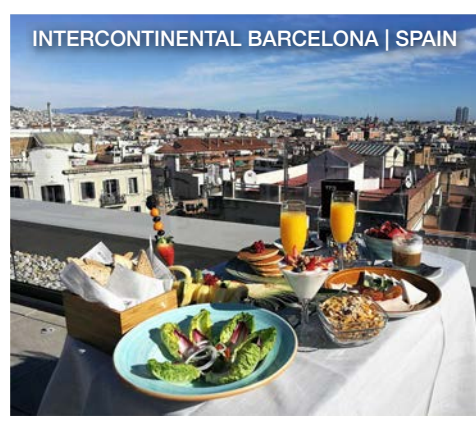
INTERCONTINENTAL BARCELONA | SPAIN