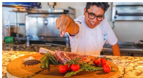
Indulge in exquisite cuisine