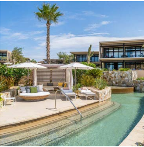
Spend the day relaxing poolside

A PREMIER BEACHFRONT SANCTUARY IN LOS CABOS, MEXICO