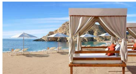
Delight in the powdery sand beach