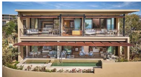
Retreat to spacious accommodations