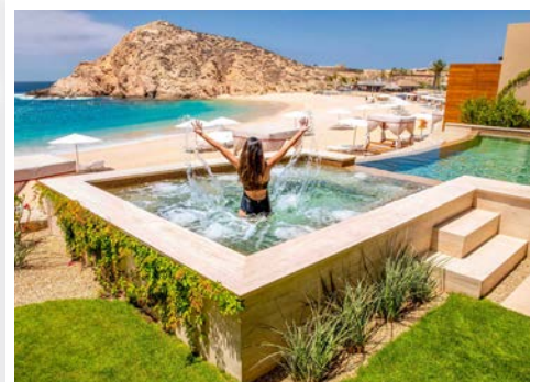
Relax in your private plunge pool

Situated along the stunning shores of Santa Maria Bay, this destination blends Baja luxury with natural beauty. Choose from elegantly appointed accommodations with one- to three-bedroom options, each boasting a fully equipped kitchen and private plunge pool. Enjoy personalized butler service, authentic Mexican dining, and fresh seafood al fresco, or relax in sparkling pools and a state-of-the-art wellness spa. Enhance your experience with onsite activities like gourmet tasting soirées, cooking classes, agave experiences, and wine or tequila tastings. Wellness therapies include morning yoga, traditional Mexican rituals, and cocoa stress relief. Together with the Journese® premier portfolio offering all classes of air service, private transfers and immersive activities including private options, a signature Mexico vacation is waiting for you.