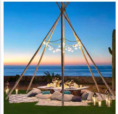
Savor a private romantic dinner