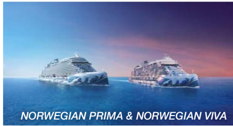
NORWEGIAN PRIMA & NORWEGIAN VIVA