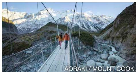
AORAKI / MOUNT COOK