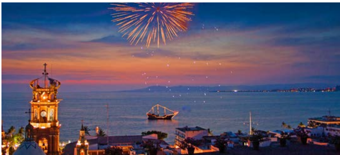
Watch fireworks burst above this beautiful city