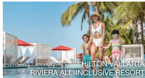
Create cherished family memories