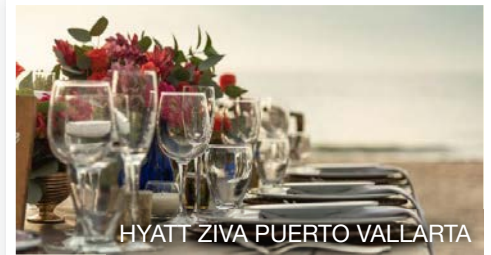
Enjoy onsite holiday events and dinners