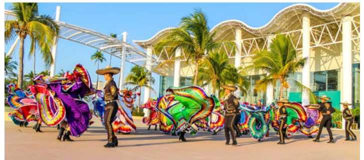
Discover the traditions of a new culture

Nestled on Banderas Bay and embraced by the Sierra Madre mountains, Puerto Vallarta offers rich cultural heritage, warm hospitality, soft coastal breezes and a vibrant shopping and dining area. This winter, celebrate the holidays or ring in the New Year on sunny beaches, with many resorts hosting special dinners, sparkling events and holiday-themed activities and more. Puerto Vallarta delights guests with colonial charm, the iconic Malecón boardwalk, bustling nightlife and adventures from snorkeling, dolphin swims and waterfall rappelling to off-road adventures, ziplines and sailing. The Journese® premier portfolio features all classes of air service, lavish accommodations, immersive activities and private transfers, for a magical Mexican holiday.