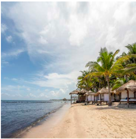
Spend the day relaxing at the golden beach

FAMILY-FRIENDLY, ALL-INCLUSIVE FUN IN MEXICO