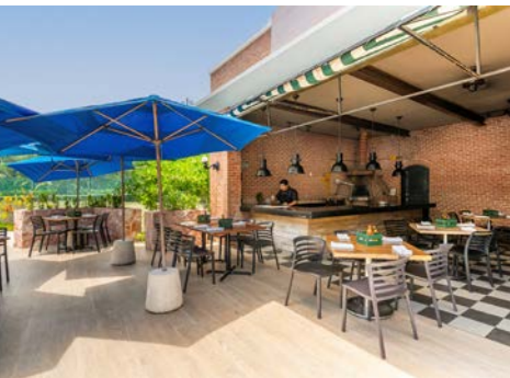
Delight in dining options at eight onsite restaurants