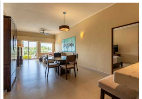
Escape to spacious, family-friendly suites

A perfect combination of relaxation and excitement, discover the beauty of Puerto Morelos on the Mexican Caribbean. This all-inclusive hidden treasure sits on a serene beach and offers charming suites including swim-up options, gourmet dining in eight restaurants and Kaab Spa & Wellness Center. Spend the day relaxing poolside, let the kids enjoy an afternoon at the kids or teens clubs and enjoy an expansive activity program including Spanish and dance lessons, cooking classes, aqua aerobics, watersports, archery and more. Together with the Journese® premier portfolio, enjoy all classes of air service private transfers, engaging activities, VIP airport lounge access and more, for a delightful Mexican escape.