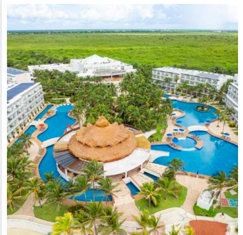
Bask in all-inclusive luxury accommodations