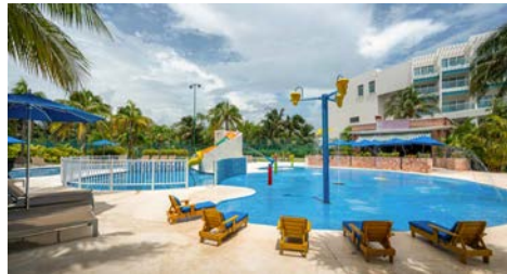
Enjoy a fun family day at the pool