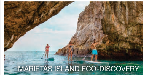
Embark on an adventurous day in the water