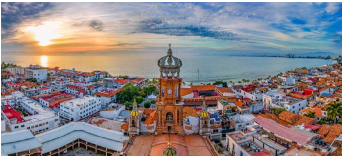
Explore this beautiful city and its historic buildings