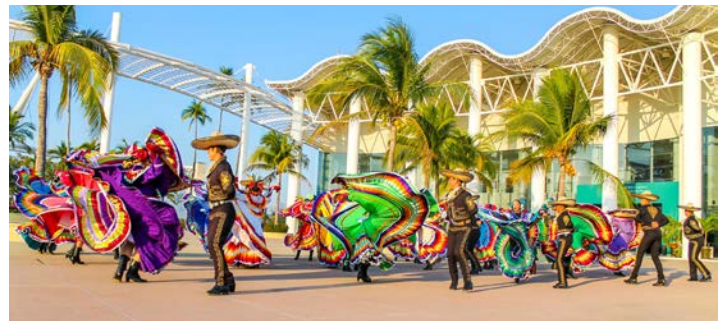
Discover the traditions of a new culture

Nestled on Banderas Bay and embraced by the Sierra Madre mountains, Puerto Vallarta offers rich cultural heritage, warm hospitality, warm coastal breezes and a vibrant shopping and dining area. Whether planning a romantic escape with your loved one, a family fun beach vacation or a relaxing friends getaway, Puerto Vallarta delights guests with colonial charm, the iconic Malecón boardwalk, bustling nightlife and adventures from snorkeling, dolphin swims and waterfall repelling to off-road adventures, ziplines and sailing. The Journese® premier portfolio features all classes of air service, lavish accommodations, immersive activities and private transfers, for a magical Mexican holiday.