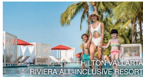
Create cherished family memories